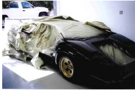
1986 Countach in the paint booth already shiny and showing promise