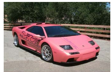
Al's 2001 Diablo 6.0 Jota® ready for road test after installation of the upgraded and tested engine