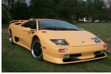
1999 Diablo SV yellow exterior – black with yellow piping interior