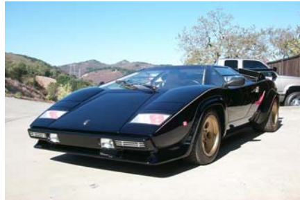
Finished and gleaming with pride Steve's baby was ready to roar again

Restoration of a 350 GT, finishing the LM002, completion of a downdraft carbureted Countach Quattrovalvole, and a myriad of other small and big projects for clients and our own cars – we have been busy. Besides all these projects we are constantly upgrading the facility to make our work better and more efficient and the car back to you as fast as possible.