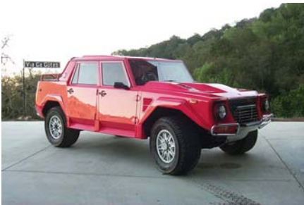
The finished product came out fantastic considering the extend of the damage this vehicle suffered