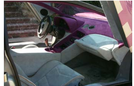
Custom alcantara interior