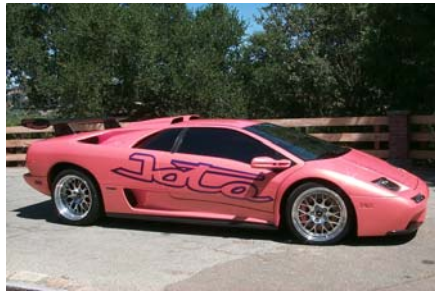
2001 Diablo 6.0 Jota® arrancio atlas exterior – black with orange stitching interior