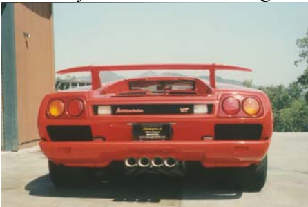
1994 Diablo VT equipped with Jota® Jr

Our mechanical service department has been busy. Besides the development of the 6.0 Jota® engine we designed a more affordable Jota® Jr. set up for the Diablos. For under $25K (less than 1/3 rd price of its big brother Jota® package and 1year / 12,000 miles guarantee) the performance is awesome. The drivability is excellent and reliability remains outstanding.