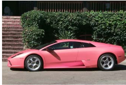
New Murcielago for developing Jota® power goodies