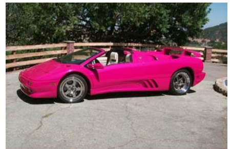
1997 Diablo Roadster Lipstick red with snowcorn interior