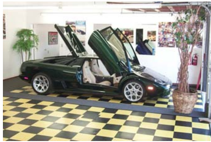
photos, drawings, sculptures and of course beautiful cars all around.