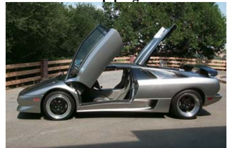
1998 Diablo SV titanium exterior - gray with black piping interior