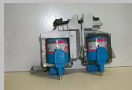
ABD Ignition Coils