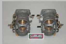
ABD Jota® Jr. Throttle bodies