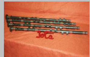
ABD Jota® Jr. Cam shafts