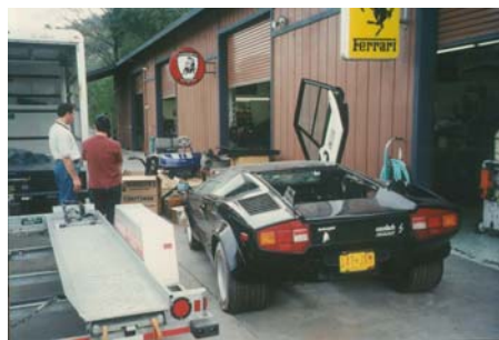
The car – 1984 Countach all apart

Resurrecting , from a pile of parts, a 1984 Countach has been quite a project. The missing and now made of unobtainium, little parts kept our machinist busy on occasion with unusual requests. Adding special touches such as ABD camshafts, 11:1 compression ABD pistons, special ABD wrist pins