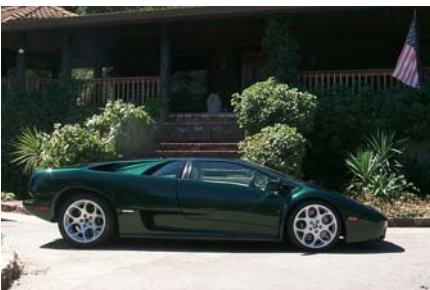
2001 Diablo 6.0 metallic emerald green exterior parchment with green piping interior