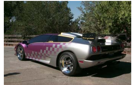
Custom paint work