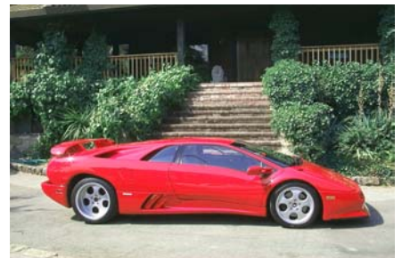
1994 Diablo SE red exterior – snowcorn with red piping interior

Al Burtoni Direct - Summer / Autumn 2003