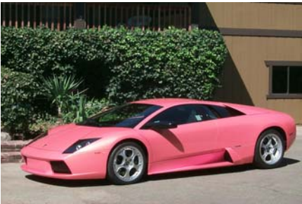
2003 Murcielago arrancio atlas exterior black with orange stitching interior