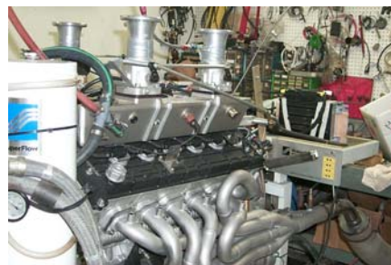
The 6.0 – 636.7 HP Jota® engine on the dyno

These results surely best the million dollar McLaren F1 with 627HP and 479 lb/ft torque.