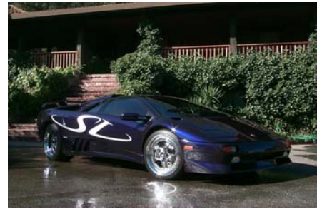
1998 Diablo SV Monterey Edition blue scuro exterior – tan interior with blue piping interior