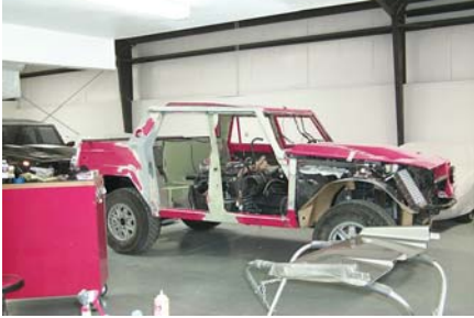
LM002 after an accident with much work already done, believe it or not.

Our body shop has been just as busy as the mechanical shop. Here are some photos of the many projects.