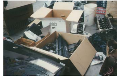
The boxes of parts for the 1984 Countach

and ABD piston rings made this project fun. Wonder what we can get out of this one on the dyno? Stay tuned!!!