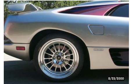
Special wheels and paint

Give us a call Let us make your baby shine cosmetically and mechanically