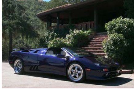
1999 Diablo Roadster blue scuro exterior – parchment with blue piping interior