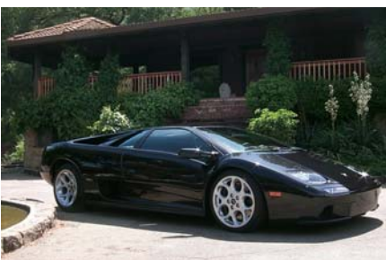
2001 Diablo 6.0 black exterior – black interior