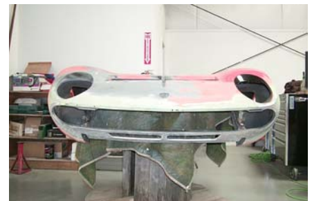
Custom repair of old rusted components

Al Burtoni Direct - Summer / Autumn 2003