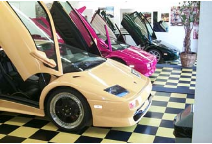
Freshly done – black and yellow checker board tile on the floor, trimmed with carpeting,