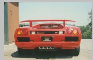
ABD Jota® Exhaust System

V12 Engineering® Gilroy, CA. 95020 Tel. 408-779-4026 Fax 408-779-4026