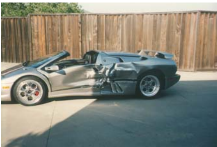
Very sad looking 1999 Diablo Roadster in for some serious body work.